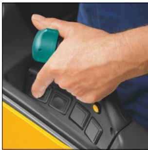
ESE 120: Controls for speed regulation and lift function