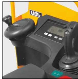
All drive and lift functions controlled by the multi-functional joystick on the ESE 220/320