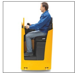
Comfortable seating position with height-adjustable footplate