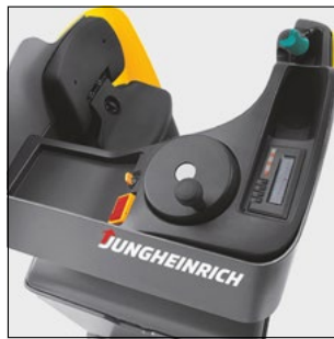
ESE 120 stand-on truck with easily accessible controls and fold-up seat